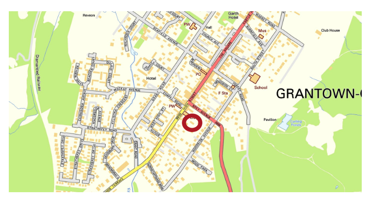
ontains Ordnance Survey data © Crown copyright and database right 2015.