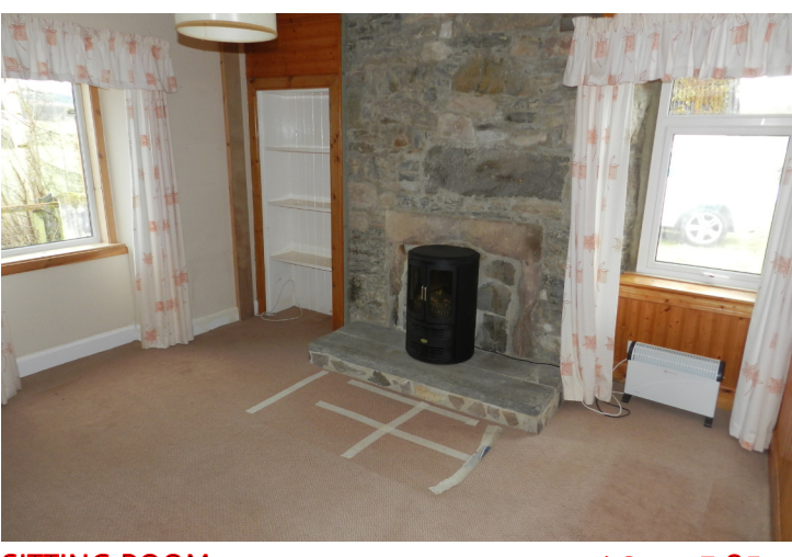
Windows to front and rear garden area. Electric stove and stone surround. Radiator.

Bright spacious and comfortable with dual aspect windows overlooking the front and side garden. Feature stone fireplace sealed off with integral flue – untested. Recess storage shelves. Electric heater. Radiator.