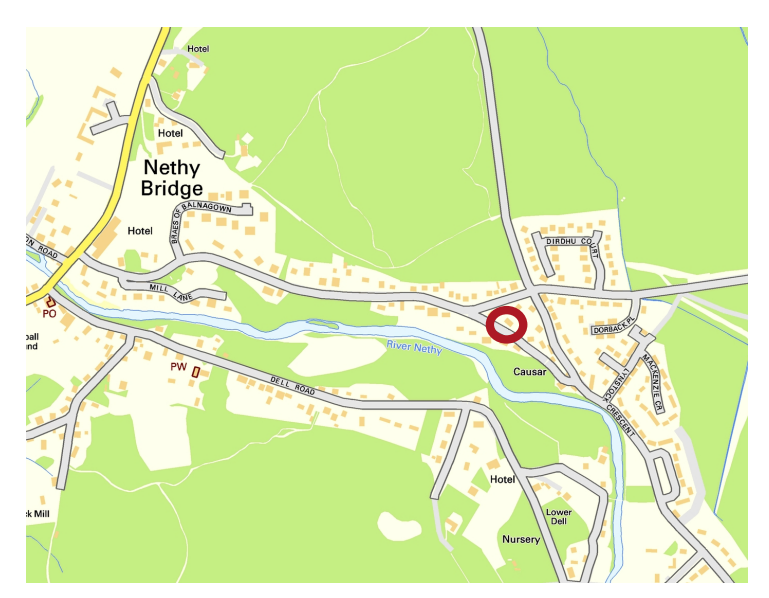
Contains Ordnance Survey data © Crown copyright and database right 2015.