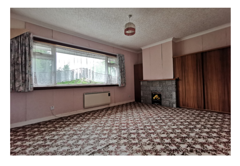
BEDROOM 2 (3.88m x 3.35m) Double bedroom with window to rear garden. Built-in double wardrobe. Radiator.

Bright room with an open fireplace overlooking front garden. Fitted wardrobe & shelves. Radiator. Opaque window to rear garden. Suite comprising bath, separate electric shower cubicle, wash basin and WC. Mirror cabinet. Radiator.