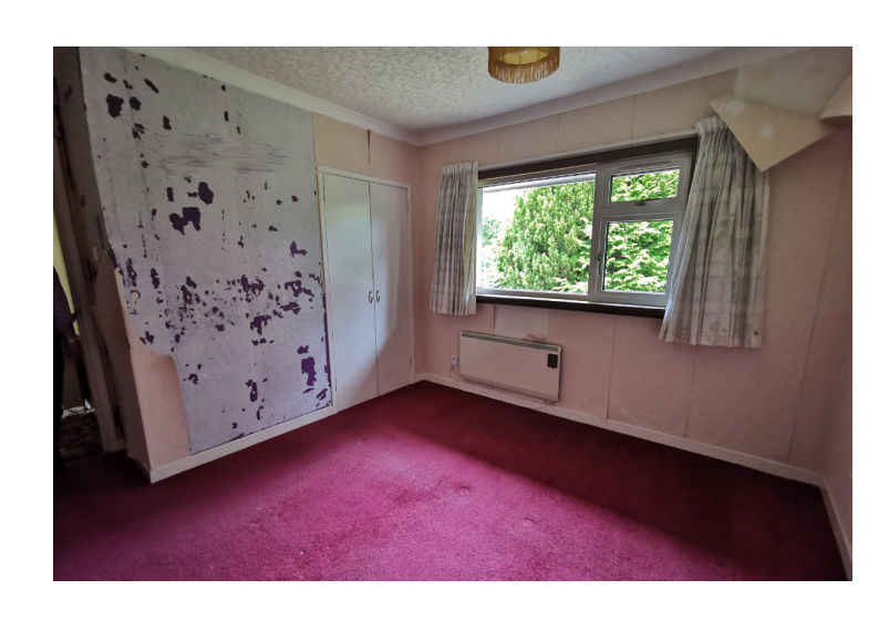
BEDROOM 3 (3m x 2.35m) Bedroom with window overlooking rear garden. Fitted wardrobe. Radiator.