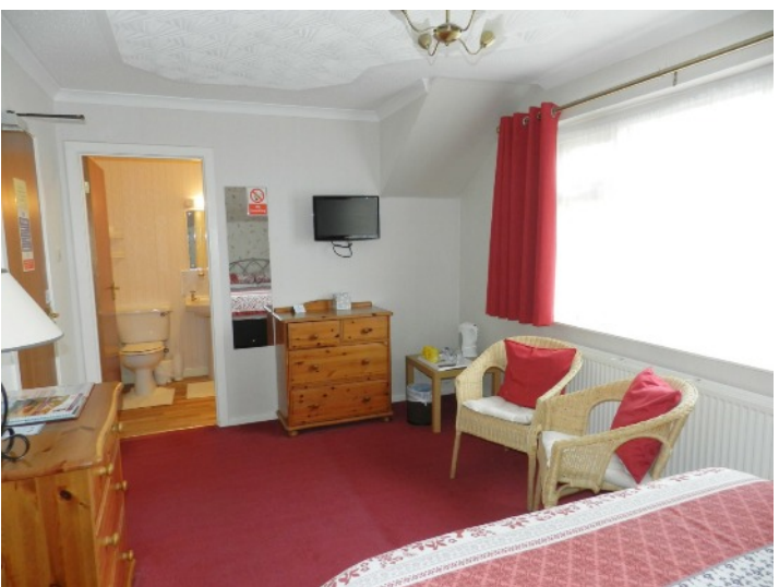
Bedroom 2 - first floor Twin bedroom with en-suite shower / WC.

Bedroom 1 - first floor Double bedroom with en-suite shower/WC.