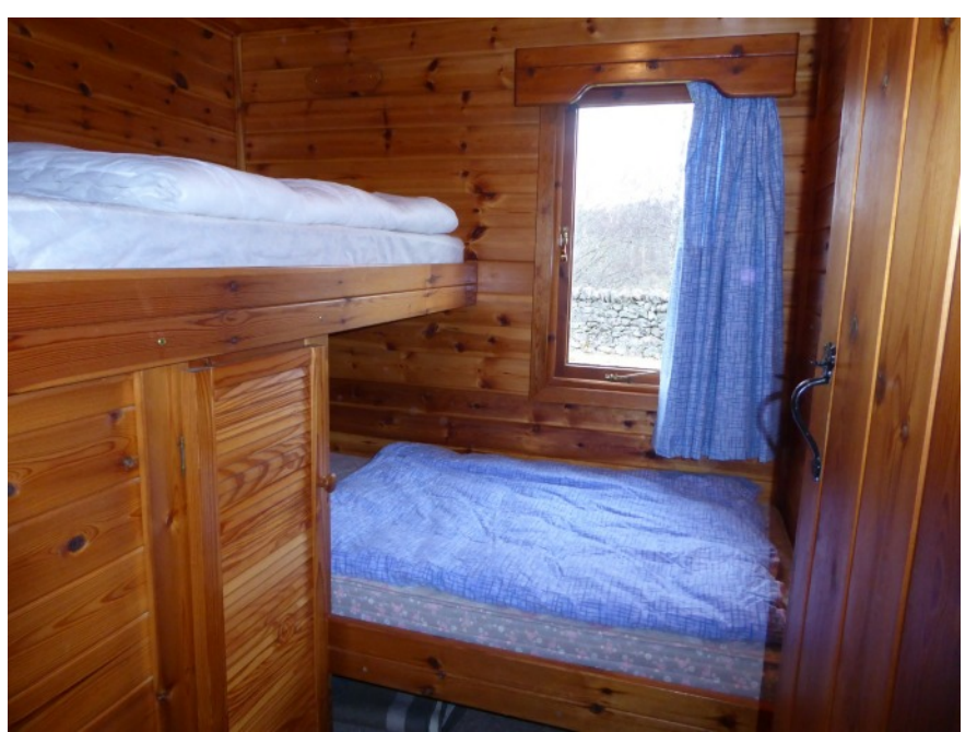
BEDROOM 2 (2.05m x 1.5m) Cosy twin bunk bedroom with built-in wardrobe and fitted bedside cupboard. Ceiling spot light. Attic hatch. Free standing electric heater.