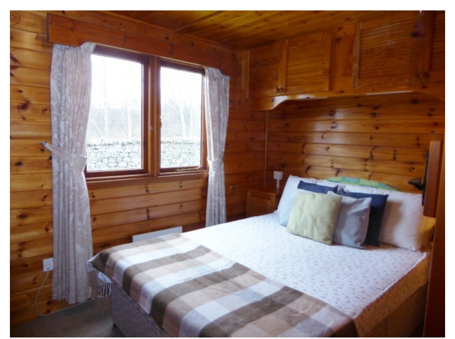
MAIN BEDROOM (2.5m x 2.35m) Built in double wardrobe. Double bed with fixed bedside cabinets and cupboards over. Ceiling spotlight and wall mounted electric panel heater.